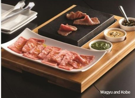
Wagyu and Kobe